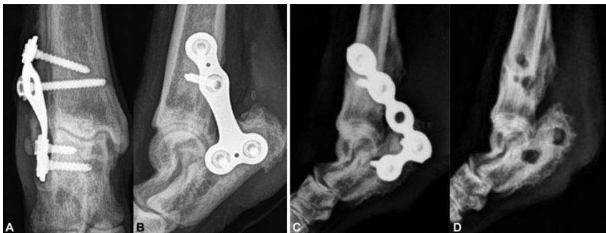
Fig. 5 Complications: Radiographic follow-up at 4 weeks (A, B) showing screw pull-out in case 7 (bacterial culture had not yielded bacterial growth). Severe case of bacterial osteomyelitis before (C) and after implant removal (D) at 6 weeks (bacterial culture confirmed Staphylococcus aureus infection) in case 1.