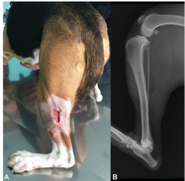
Fig. 1 (A) Clinical presentation of a dog with complete common calcaneal tendon lesion and plantigrade posture; (B) Mediolateral radiographic view with hyperflexion of the hock joint.

All dogs presented with partial or complete common calcaneal tendon rupture treated with primary tendon repair supported by the transarticular calcaneo-tibial locking plate