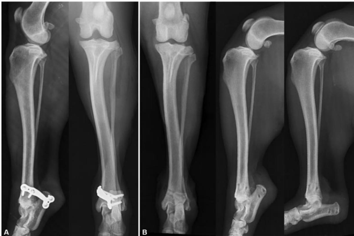
Fig. 6 Radiographic follow-up at 4 weeks (A) and at 6 weeks after implant removal (B).

available for follow-up contact, and in all instances the owners reported that they had not observed any recurrence of lameness.