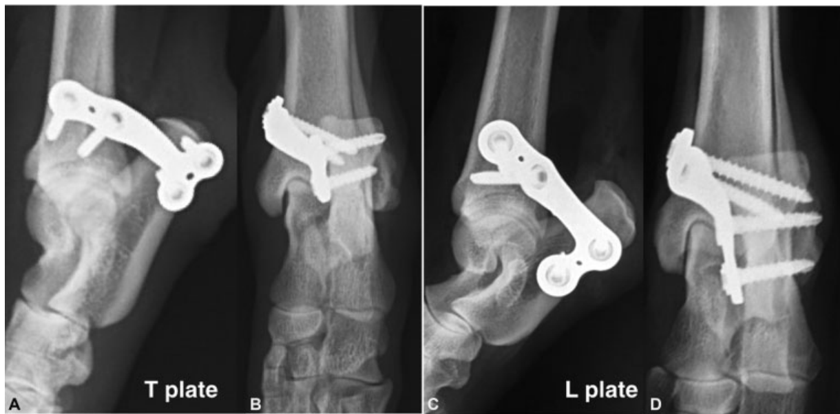
Fig. 4 Postoperative radiographs of medial 'T' plate (A, B) and 'L' plate (C, D) application.