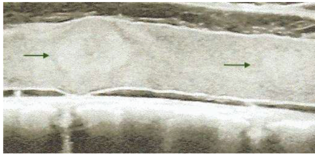
Fig. 3 Intraoperative ultrasonography with identification of intramedullary spinal cord granulomas.