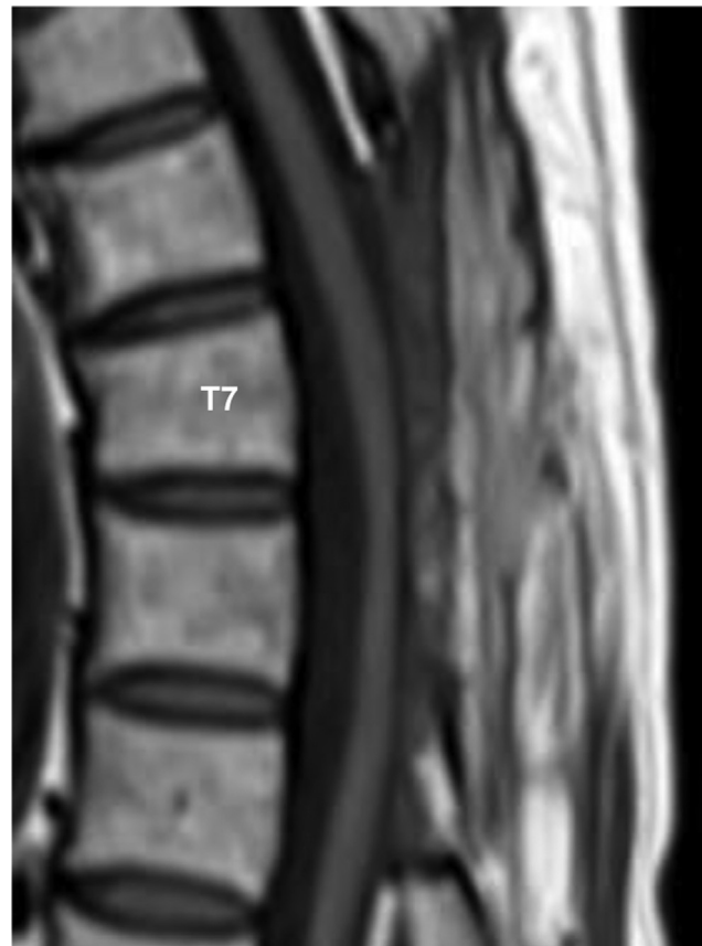
Fig. 2 Postoperative sagittal MRI scan shows total resection of the lesions.

A year after the surgical treatment, the patient presented a positive evolution, and was capable of ambulation with the aid of metal bars.