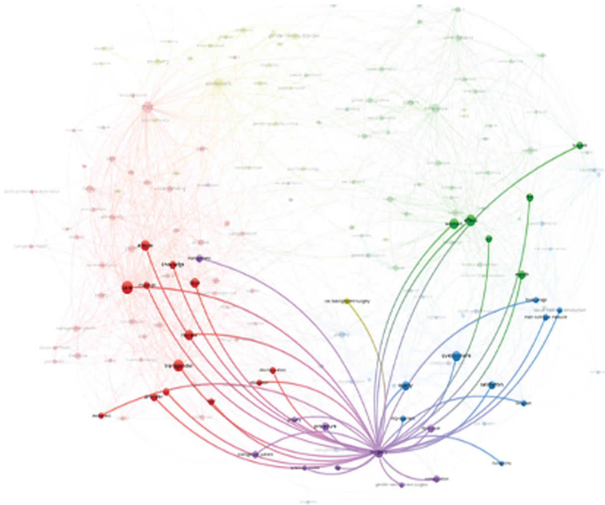
Fig. 3 Co-occurrence network figures using the term: "surgery".

In ► Figure 3 we clustered results around the topic "surgical treatment" and found that there is poor publishing correlation to other topics.