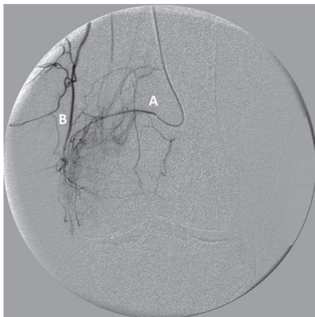
Fig. 2 The medial superior genicular artery (MSGA) (A) is selected and anastomoses between the MSGA and the musculoarticular branch of the descending genicular artery (B) is visualized.

Another major challenge to GAE is preventing nontarget embolization. Cutaneous arteries may be confused for genicular synovial branches leading to multiple side-effects. Cutaneous arteries appear perpendicular to the main genicular arteries extending to the cutaneous surface, and embolizing proximal to these vessels may lead to cutaneous ischemia. Although most often reported as subclinical and self-resolving, the possibility of ulceration is present. The presence of a common origin, especially of MSGA/LSGA, is an important consideration, as reflux could lead to nontarget embolization to the asymptomatic side. Similarly, collateral networks can cross the joint space and anastomose with ipsilateral and contralateral vessels. Recognizing the typical anatomy and anticipating for variants are vital for best patient outcomes and minimizing risk.