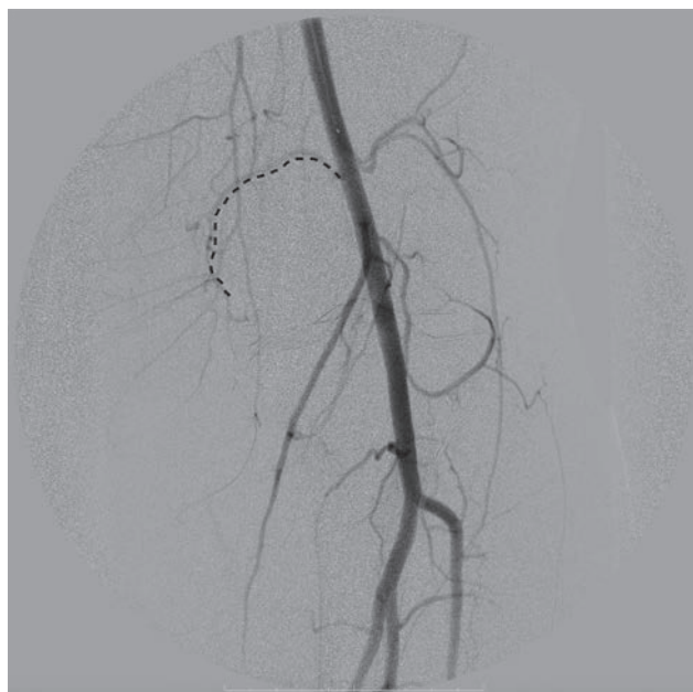
Fig. 3 The acute angle of origin of the medial superior genicular artery relative to the proximal popliteal artery is demonstrated.