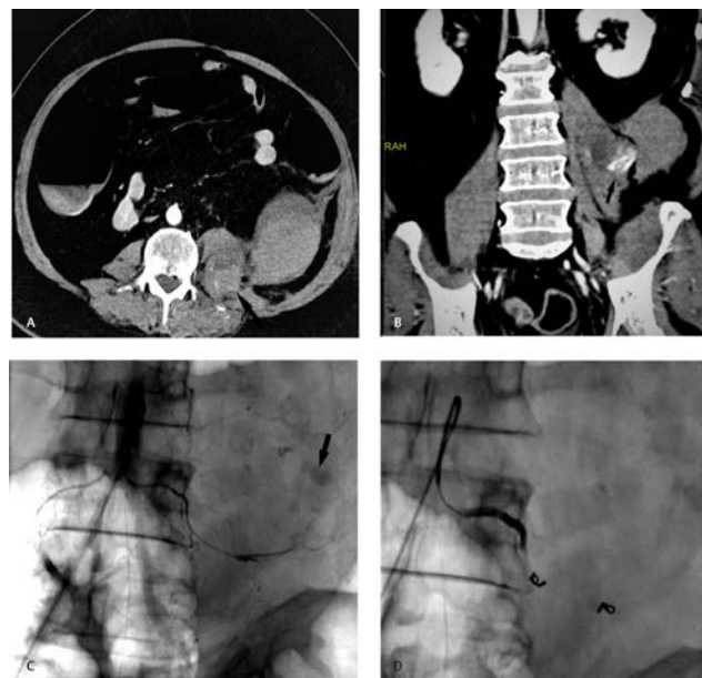
Fig. 3 A large left retroperitoneal hematoma. Contrast-enhanced computed tomography (CECT) axial image in the arterial phase (A) showing a large hematoma in the left psoas, quadratus lumborum, and adjacent retroperitoneum with contrast extravasation. Three minutes delayed phase CECT coronal image (B), showing further pooling of contrast (arrow). Angiogram of the left 4th lumbar artery pre-embolization (C) showing contrast extravasation (arrow in C) and postembolization angiogram (D) showing the coils and successful occlusion of the artery.

CECT revealed thickened edematous left psoas muscle and adjoining large extraperitoneal hematoma extending to the left anterolateral abdominal wall (►Fig. 3).