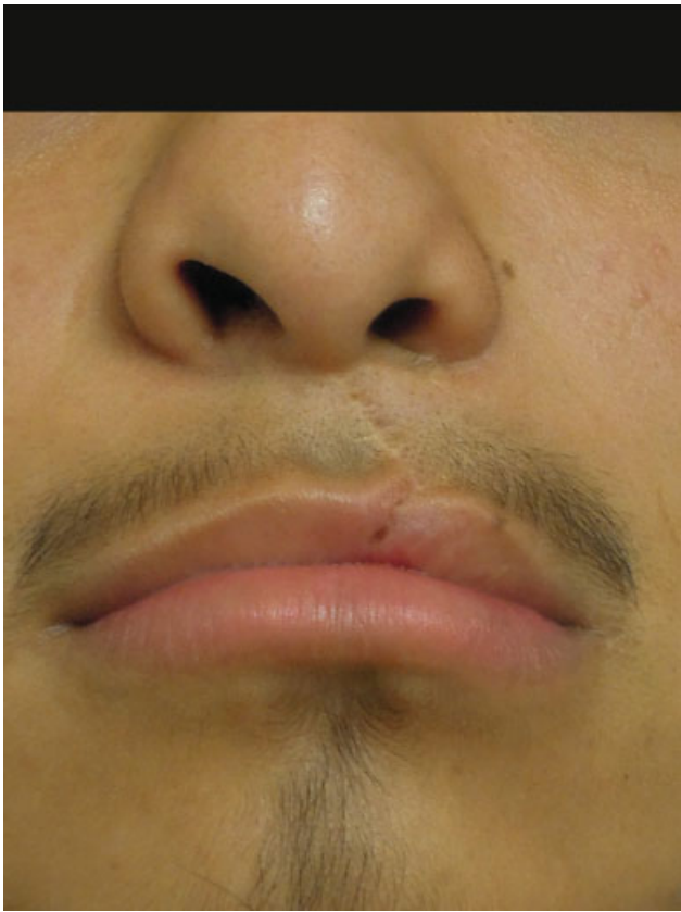
Fig. 5 Left nasal obstruction presenting after prior repair of left unilateral cleft lip/nasal deformity.

school age to young adulthood for definitive treatment (► Fig. 8 ). Several reconstructive options have been proposed to manage columellar necrosis including full-thickness skin graft, composite auricular graft and local flaps from the nose, upper lip, or cheek. 56–62 More complex deformities involving the soft tissue triangle or ala may incorporate these techni-