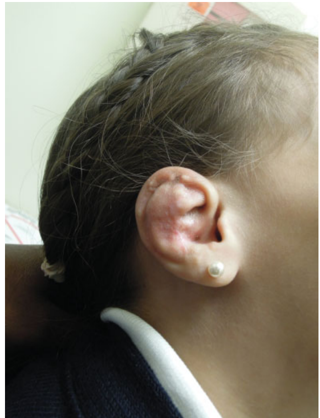
Fig. 3 Postoperative view after two-staged repair of cauliflower ear deformity.

mechanism, and details of the injury. This process becomes more challenging in an unwitnessed event. Regardless of the mechanism, these situations tend to be traumatic and upsetting for families. In a trauma setting, there are potentially additional injuries and a thorough survey by the evaluating trauma team must be performed, ensuring that the airway, breathing, and circulation are stable. When an intracranial injury is present, neurosurgical evaluation is mandatory. Soft tissue injuries involving periorbital tissues or the globe itself require an ophthalmological evaluation. Though not the focus of this article, it is important to highlight the impor-