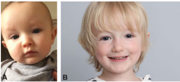
Fig. 13 Postoperative views after repair of nostril stenosis: (A) 6 months follow-up and (B) 4 years follow-up.

public must continue to be educated about the dangers that dogs pose to young children. Staged reconstructive procedures and long follow-up periods are important aspects of care for complex facial wounds in the pediatric population.