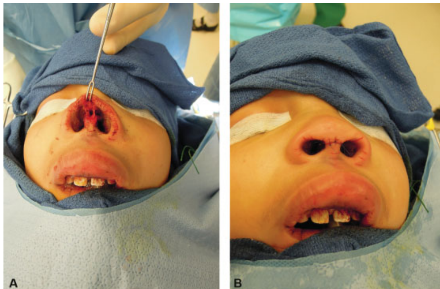
Fig. 4 Columellar injury with deep extension to medial crura in toddler after fall: (A) Preoperative view and (B) postoperative view. Reproduced with permission from Butts et al. 74

For animal bite wounds, potential transmission of rabies must be considered from wild animals, especially bats or carnivores, or from a domestic animal with uncertain immunization status. 29 Improved canine vaccination programs and stray animal control has led to a marked decrease in domestic animal rabies cases in the United States since World War II. 30 The Advisory Committee on Immunization Practices and World Health Organization recommendations for post exposure prophylaxis, which includes human rabies immunoglobulin and vaccination, depend on the availability of the animal for observation or rabies testing. 30 For most other carnivores (e.g., skunks, raccoons, and foxes) and bats, immediate prophylaxis should be considered unless the animal has been proven negative by a laboratory test. 30 Notification of public health officials is recommended if there is uncertainty. Assessment for hepatitis B virus infection and risk of human deficiency virus should be considered in human bite wounds. 29