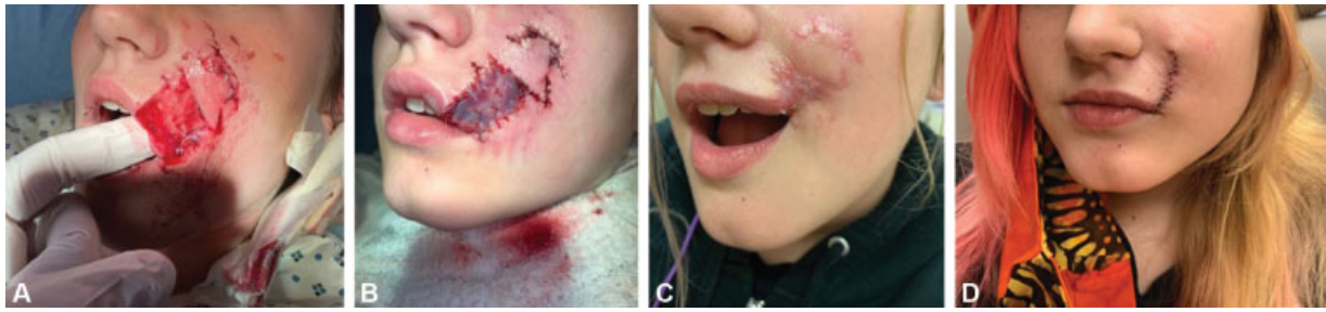
Fig. 7 Use of dermal allograft delayed repair of wound with significant tissue loss after dog bite to the perioral area: (A) presentation, (B) postoperative view, (C) well-incorporated graft 6 months postinjury, and (D) delayed definitive repair.