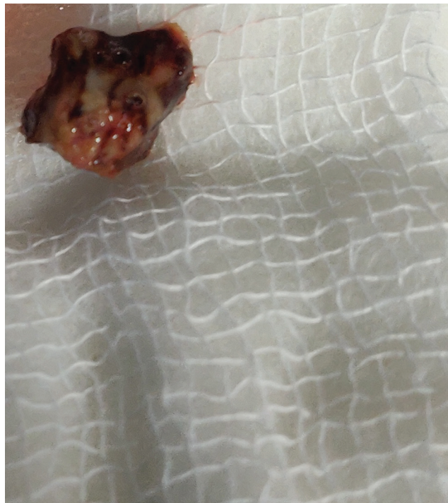
Fig. 3 Aspirated betel nut.

was performed but we failed to extract the betel nut; as it was lodged in the distal LMB, rigid bronchoscopy forceps were not opening completely at that location and could not grasp the FB even after multiple attempts. Subsequently, we performed the flexible bronchoscopy under local anesthesia; Fogarty catheter was passed through the space available between the betel nut and superomedial wall of the bronchus so that balloon could be inflated just distal to the impacted betel nut. With moderate traction the FB was dislodged; however, due to edematous LMB, it took multiple attempts with Fogarty catheter to pull up the FB toward the carina (►Fig. 2).