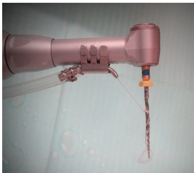
Fig. 1 Rotary/endomotor handpiece with attached irrigation apparatus.

Before the start of the study, HMCIS was assembled (and tested) by attaching one side of a 90-cm long silicone tube (with 2 mm internal diameter) to a 10-mL disposable leu-