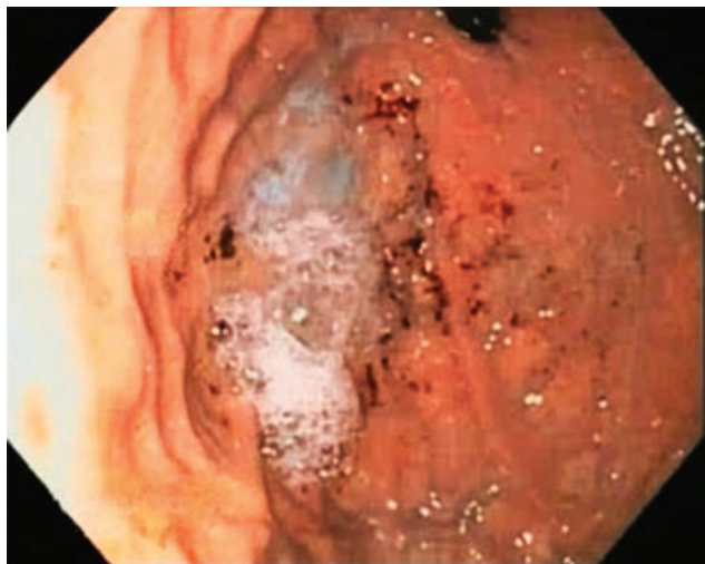
Fig. 2 Endoscopic insufflation–induced gastric barotrauma grade 1 presenting as appearance of petechial spots in the fundus with no discernable mucosal breaks.