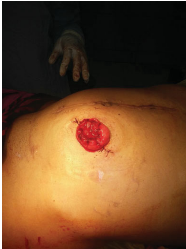
Fig. 4 Anastomosis of the one-layer colocolostomy.

first experience of management of complicated prolapsed stoma using this technique. Moreover, the technique is simple, presents a low risk of operative and postoperative complications, and enables an early recovery, with a lower risk of recurrence during the first 6 months after the repair. We used the hand-sewn Altemeier technique, which saved the costs of using staples.