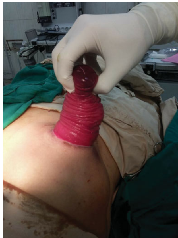
Fig. 1 Assessment of the prolapsed end colostomy (descending colon).

The surgery was performed under general anesthesia. After prepping and draping the patients, we started a round incision at ~ 1.5 cm to 2 cm distal to the mucocutaneous junction, through the outer cylinder of the prolapsed