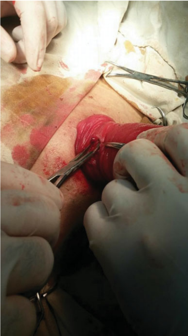
Fig. 2 Line of dissection to separate the outer and inner tubes.