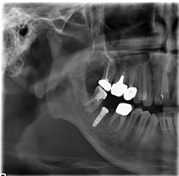
Fig. 2 Half-panoramic X-ray showing the correct endosseous implant position and perfect integration of the bone graft.

At first dental visit the patient reported intense pain in the right lower second molar, with impaired chewing function. The dental element had previously undergone endodontic treatment, but at this time it is still painful to percussion due to an evident osteolytic lesion at the periapical level. A second endodontic treatment was then performed, without any haemostatic covering therapy, but paying particular attention to the positioning of the hook for the rubber dam and using a particular delicacy in the endocanal instrumen-