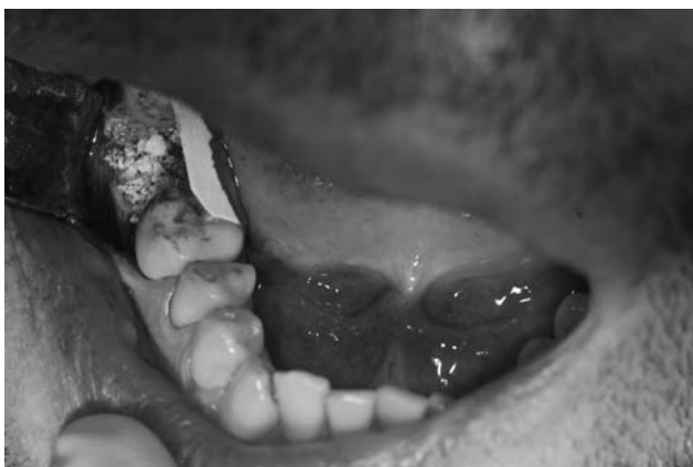
Fig. 1 Bone grafting and the membrane during its placing.

Here we report a case of a patient with mild haemophilia A undergoing implant-prosthetic rehabilitation, his management and outcomes.