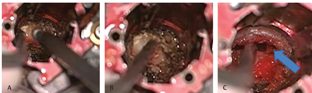
Fig. 2 (A) Undercutting of opposite lamina using high-speed drill in “over the top” minimally invasive surgical (MIS) decompression. (B) Tip of suction cannula points to the opposite lamina which has been “undercut.” (C) Complete decompression after undercutting of opposite lamina and excision of ligamentum flavum. Blue arrow shows the traversing nerve root.

After laminotomy is adequately achieved, ligamentum flavum is excised to visualize thecal sac, opposite traversing root and the opposite pedicle (►Fig. 2C). Adequate decompression is achieved if the medial border of the inferior pedicle can be felt with a ball-tip probe. If adequate decompression has not been achieved, then medial portion of the facet joint is removed, taking care not to disrupt more than 50 percent of the facet to avoid instability. In case of bilateral stenosis, decompression (laminectomy and decompression) is performed on the ipsilateral side, that is, on the side of incision followed by opposite side decompression.