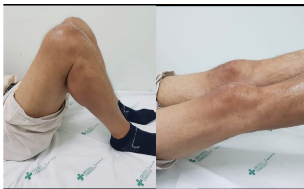
Fig. 2 Quadriceps tendon injury of the left knee and termino-terminal suture of the quadriceps tendon.

disinsertion of the quadriceps tendon was identified in the proximal region of the kneecap. After hematoma removal, repair of the stump proximal to the upper kneecap pole was performed using the Krackow 6 technique with nonabsorbable number-2 wires (Ethibond, Medline Industries, Inc., Northfield, IL, US). We also used two 5-mm anchors in the upper pole of the patella, thus performing the tendon reinsertion, with the knee at 40° of flexion. The left knee injury was approached with a similar incision: a complete lesion was observed in the myotendinous junction of the quadriceps tendon, and the termino-terminal suture was performed using the the Krackow 6 technique with Ethibond number-2 wires, with the knee at 40° of flexion (→ Fig. 2). In both knees the retinacular lesions were reassembled with Vycril 2.0 (Ethicon, Somerville, NJ, US).