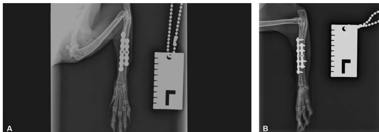
Fig. 3 (A) Craniocaudal radiograph of the left forelimb 8 weeks postoperatively. (B) Mediolateral radiograph of the left forelimb 8 weeks postoperatively.

The bone ends of both the radius and ulna were osteotomized in this present report. This likely aided in both bone healing and bone remodeling as it allowed for complete and perfect reduction without undue force. Furthermore, allowing the bone cortices to meet and thus enabling a degree of load-sharing are vital in early progression of bone healing and protecting the implant from over-loading. 1 An additional advantage of osteotomizing the bone ends was that it opened the medullary cavity (blood supply) of the bones which had been sealed with fibrous tissue due to the delay in time between injury and repair. We felt that the limb shortening caused by doing this was not clinically significant. An investigation into what length of the radius can be osteotomized before locomotion is affected should be evaluated.