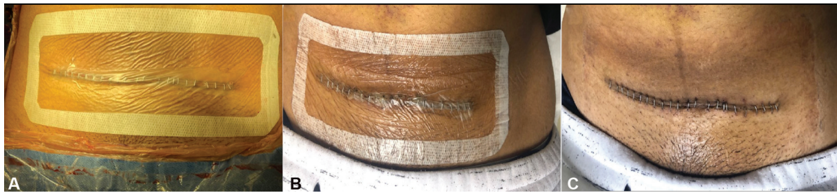
Fig. 1 (A–C) Illustration of the ReliaTect Post-Op Dressing at postoperative day 0 (A) and 7 before (B) after dressing removal (C).

Wound incision, skin, and subcutaneous fat tissue closure were all left at the surgeon's discretion. At our institution, skin closure is either performed with staples or with 3–0 poliglecaprone 25 sutures (Monocryl, Ethicon, Somerville, NJ). Suture closure of subcutaneous fat was performed when the fat thickness was more than 2 cm.