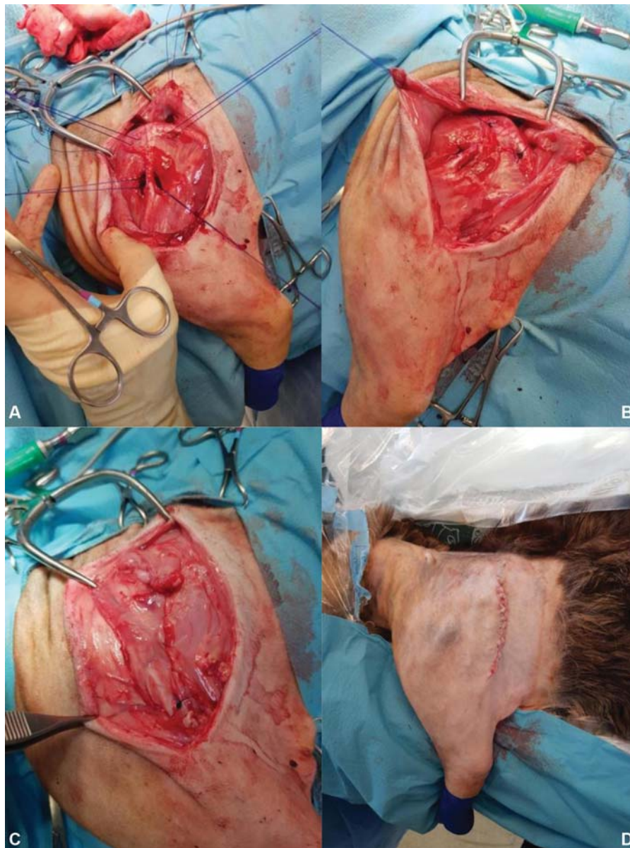
Fig. 3 Intraoperative view; a partial myotomy has been performed of the trapezius muscle and the cut muscle ends are tagged with stay sutures. (A) Pre-placement of all sutures prior to tying. There are four sutures in total; one cranial and the other caudal to the scapular spine which pass through paired bone tunnels in the body of the scapula and subsequently pass circumcostally around the second rib; two sutures in the dorsal cranial and caudal border of the scapula, passing through paired bone tunnels and through the serratus ventralis muscle. The scapula is held adducted to the thoracic wall in preparation for sequential suture tying from ventral to dorsal. (B) Position of the scapula, held in adduction by the tied sutures. (C) Muscular reconstruction. (D) Skin closure.

scapula against the thoracic wall was evident during walking and on manipulation compared with the right side; however, palpation and manipulation elicited no pain response. The left scapula was stable and could not be displaced on manipulation.