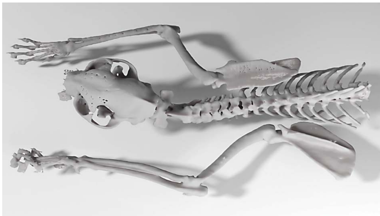
Fig. 1 Three-dimensional computed tomography reconstruction showing complete left scapular avulsion with rotation on the long axis such that the supraspinous fossa is facing dorsomedially towards the left thoracic wall and the subscapular fossa is facing ventrolaterally towards the skin surface. The shoulder joint remains intact; hence, there is an abnormal angulation of the lower limb.

At the level of the mid-body of the scapular spine, two parallel 2 cm incisions were made through the deep fascia, one cranial and the other caudal to the scapular spine, to enable elevation of the supraspinatus and infraspinatus