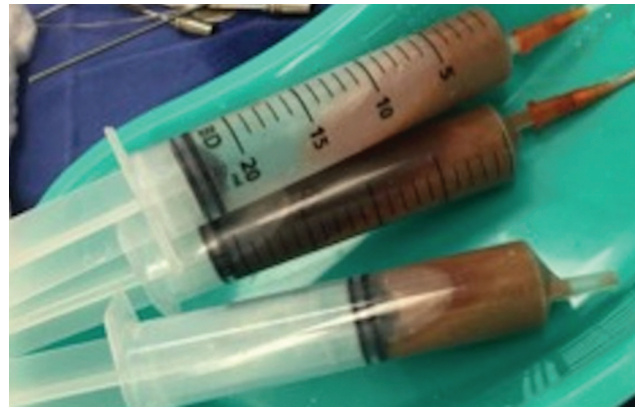
Fig. 3 Macroscopic aspect of purulent material surgically drained.

life-threatening infections are low-birthweight infants, premature, immunodeficient and long-term hospitalizations. 11,14 These risk factors are supposed to be associated with an immature immune system and a low density of intestinal microflora predisposing the individual to more severe infections. 15 The pathogenesis of this infection is still poorly understood, nevertheless recently researchers proved the C. sakazakii can survive and multiply within the brain capillary endothelial cells in rats 16 and in human microglial