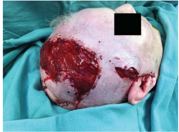
Fig. 5 Well-perfused vastus lateralis free muscle flap with supportive heparin drip at 200 unit/hour.

months. This intraoperative anticoagulation protocol is the current protocol that the senior author uses when facing pedicle thrombosis in microsurgical cases. The use of apixaban at higher doses initially and then decreasing the dosage was a direct recommendation from the consultant hematologist at our institution.