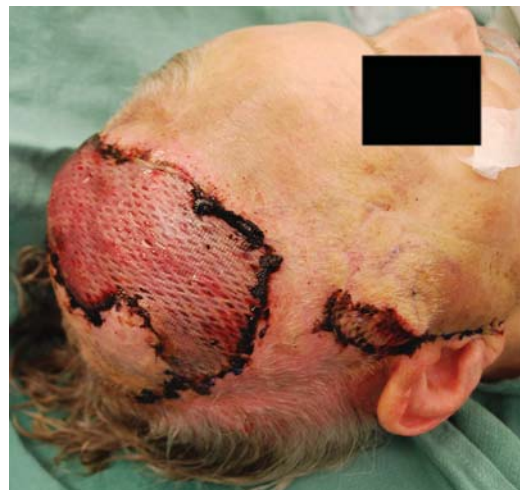
Fig. 6 Postoperative day 12 with viable flap and good skin graft take. Anticoagulation transitioned to apixaban 5-mg orally twice a day.

GBMs grow rapidly and are often quite large before symptoms arise. Despite optimal treatment, the cancer often