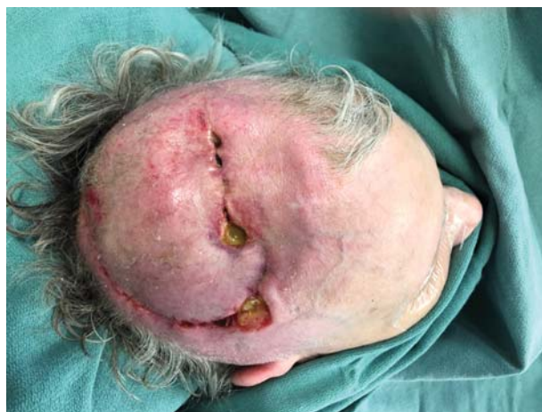
Fig. 1 Irradiated scalp wound with recurrent infection and multiple draining sinuses 7 weeks after local flap closure.

She was returned to the operating room where extensive bony debridement was performed.