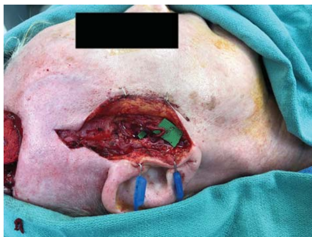
Fig. 2 Exposure of superficial temporal artery and middle temporal vein following extensive debridement.

Attention was now focused on the right thigh where a distal vastus lateralis muscle flap was harvested providing a lengthy pedicle (~11 cm) that would permit a microvascular anastomosis without the need of vein grafts (→ Fig. 3). Following ligation of the vascular pedicle, the later circumflex femoral artery was copiously irrigated with heparinized saline until a clear venous effluent was present. The flap was delivered to the head and neck and inset covering the exposed dura. The muscle was sutured to the perimeter of the bony defect utilizing a series of cranial drill holes in an effort to prevent compression of the underlying brain. The superficial surface of the pedicle was marked with a surgical