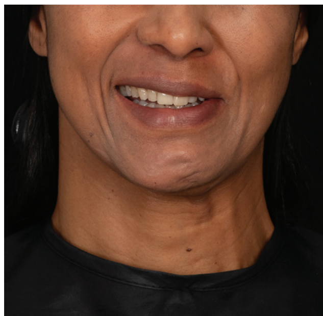
Fig. 6 Patient with left platysmal synkinesis, mentalis puckering, and downturned left oral commissure before treatment.