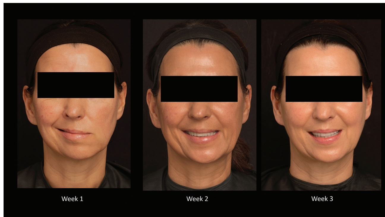
Fig. 3 Record of weekly recovery in a patient with Ramsey Hunt syndrome, demonstrating excellent recovery.

Facial paralysis is an intricate condition which may be exceedingly challenging to describe, measure, and follow-up. A recent comprehensive review of clinician-rated scales revealed no