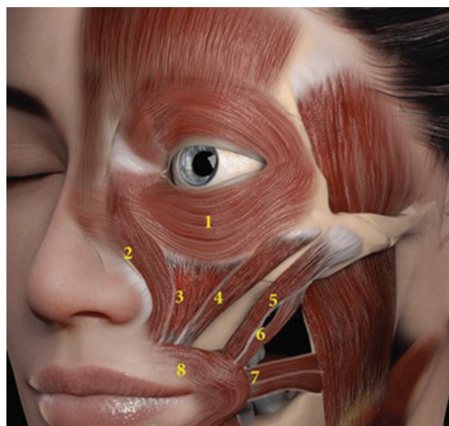
Fig. 8 Perioral muscles of animation. (1) Orbicularis oculi; (2) levator labii superioris alaeque nasi (LLSAN); (3) Levator labii superioris; (4) Zygomaticus minor; (5) Zygomaticus major; (6) Levator anguli oris; (7) Risorius; (8) Orbicularis oris (OO). 5

When treating patients with either BoNTA or HA fillers, it is imperative that injectors have a deep understanding of agonist and antagonist muscle groups, as levators and depressors work in opposition for normal, balanced facial expression (►Fig. 8). Understanding the position of the individual anatomical muscle layers is of paramount importance. While the optimal frequency of BoNTA treatment varies according to individualized needs, clinical practice verifies earlier studies