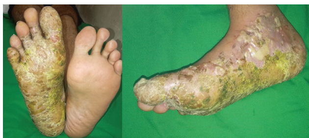
Fig. 1 Tense blisters and crusting on sole of right foot and lateral margin.