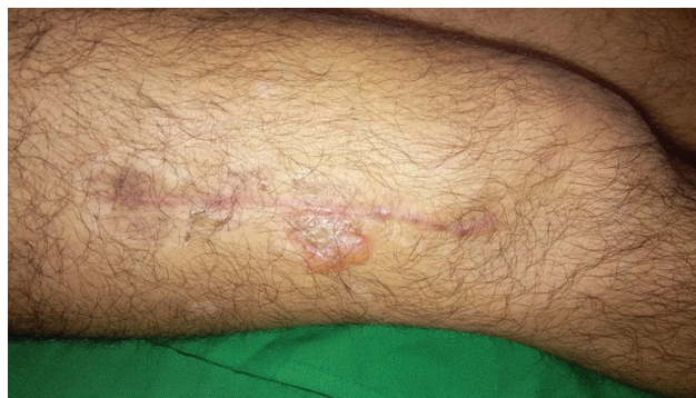
Fig. 2 Flaccid clear fluid filled blister on scar area on right thigh.