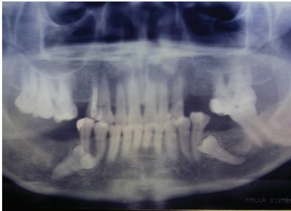
Fig. 2 Panoramic radiograph showing three impacted supernumerary premolars in mandible; one in quadrant three and two in quadrant four. The supernumerary premolars shapes are nearly identical to their homologous teeth.

premolars. Distomolars were the second most common type of ST (33.3%) in cases of multiple hyperdontia.