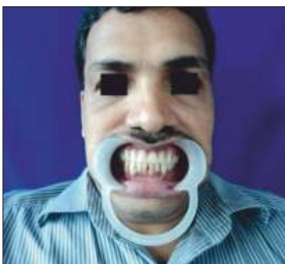
Fig 7 : Final prosthesis in the patient's mouth