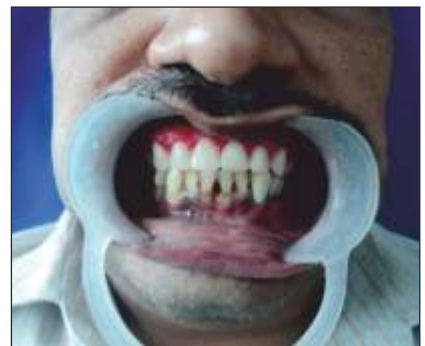
Fig 6 : Esthetic try in and verification of trial denture