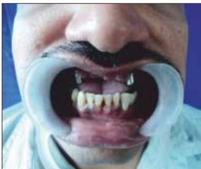
Fig 4 : Primary copings cemented on the abutments