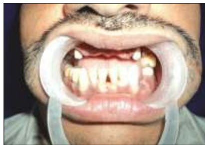
Fig 2 : Tooth prepared to receive primary copings