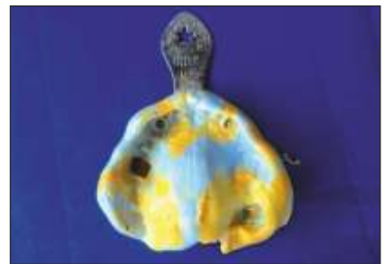
Fig 3 : Impression made with putty and light body of polyvinyl siloxane impression material.