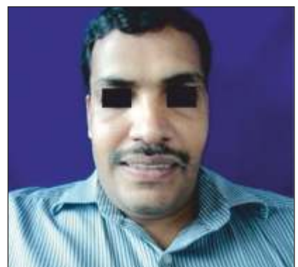
Fig 9 : post op view