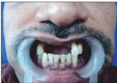
Fig 1 : Pre-op Vie

A Cast partial denture framework with a circumferential clasp on the molars and mesh work minor connector over the copings was fabricated (fig 5). Occlusion rims were fabricated over trial denture base. Horizontal and vertical