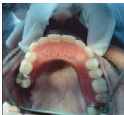
Fig 8 : Intra view of the palateless overdenture