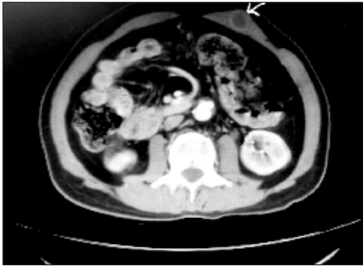
Fig. 1 : CECT abdomen showed well defined lesion in right rectus muscle suggestive of a soft tissue metastasis in the anterior abdominal wall.