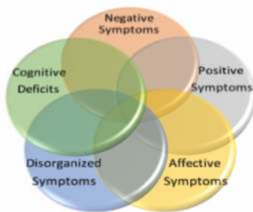
Figure 1. The Heterogeneous Nature of Schizophrenia