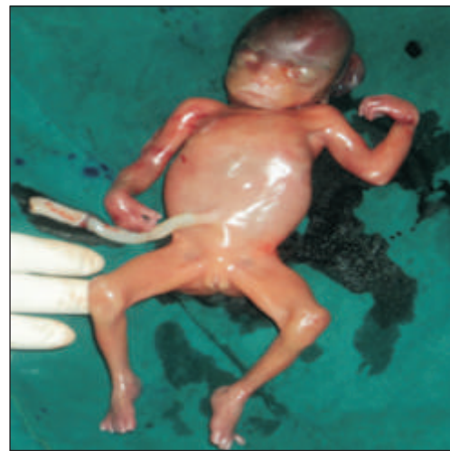
Figure 4. Fetus with enlarged abdomen and ocular hypertelorism.