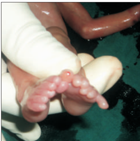
Figure 5. Fetus with sixth toe in both feet.

cerebral or cerebellar hypoplasia, hydrocephalus with or without Arnold - Chiari malformation, absence of olfactory tract or lobe, absence of Corpus Callosum and septum pellucidum may also be seen in this condition. Microphthalmia, cleft palate, micrognathia, ear abnormalities and short neck may also be seen 1 .