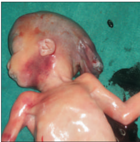
Figure 3. Fetus with deficient occipital bone with out-pouching of contents of brain.