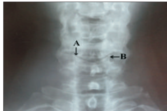
Figure 4. Anteroposterior view of x-ray of neck showing A- Uncus, B- Uncovertebral joint.