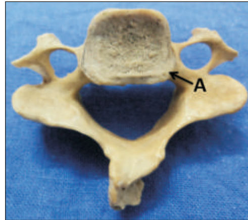
Figure 2. Superior surface of cervical vertebra showing A-Beveled inferolateral surface.