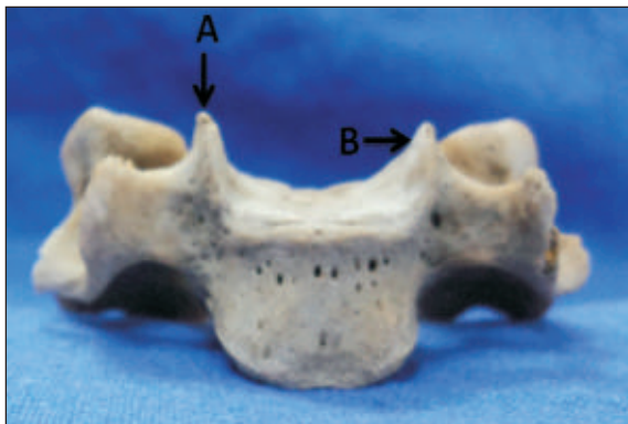
Figure 3. Anterior surface of cervical vertebra showing A- Uncus, B- Articulating facet.