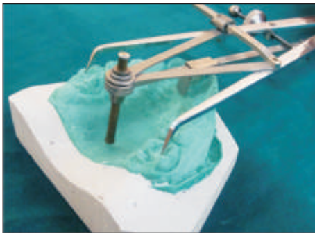
FIGURE 1-DENTAL ARCH MEASUREMENTS