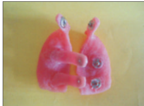
Fig 2: Sectional impression tray with snap fit pins