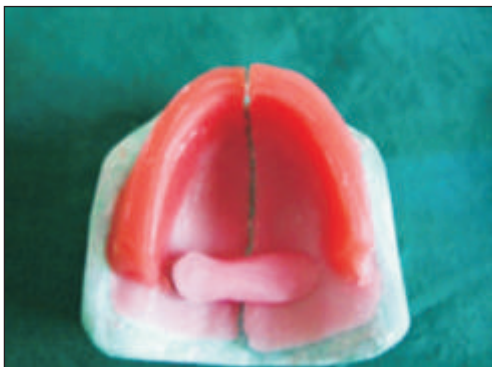
Fig 5: occlusion rims in two sections