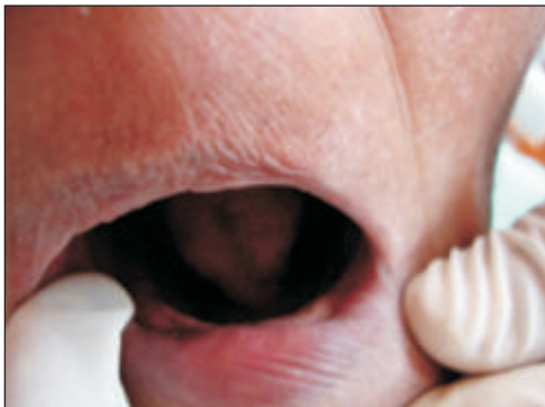
Fig 1: Limited mouth opening