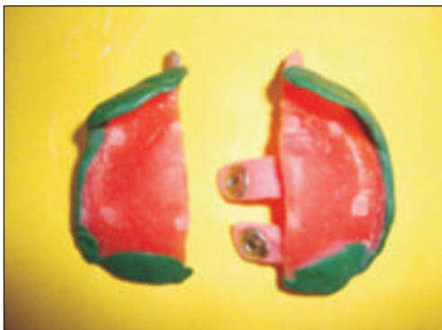
Fig 3: Border molding in sections