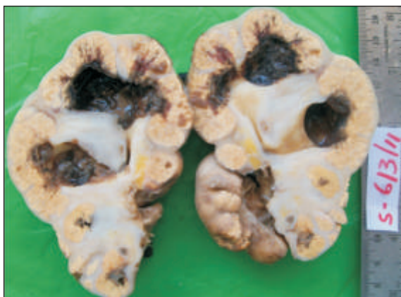
Figure 1) Gross specimen of non-functional kidney, cut section showing dilated calyces, thinned out parenchyma and multiple yellowish masses.

To conclude, XGPN is a rare cause of chronic pyelonephritis occurring in non-functioning kidney especially in diabetics and with renal calculus, poses a preoperative diagnostic dilemma which may mimic renal tuberculosis and tumors. Nephrectomy is the surgical treatment of choice and aid in definite histopathological diagnosis of this condition.