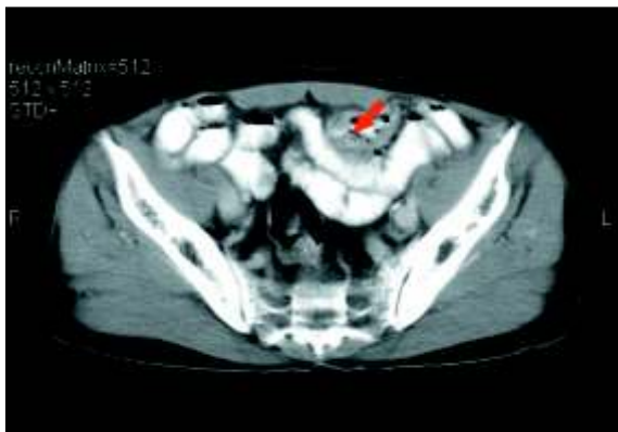
Figure 1) CT scan abdomen showing short segment of asymmetrical bowel wall thickening of small bowel (arrow).

were the first to describe such a tumor in the small bowel and named it enteroblastoma. [5] Other authors used terms like Sarcomatoid carcinoma, Carcinosarcoma, metaplastic carcinoma and spindle cell carcinoma. [3] Some authors have considered Carcinosarcoma or Sarcomatoid carcinoma as tumors with sarcomatous features immunoreactive for cytokeratin and epithelial membrane antigens but lacking carcinomatous component as was seen in our case. Shoji highlights the difficulty in making the correct diagnosis since Sarcomatoid component closely resembles sarcoma except for cytokeratin immunoreactivity. [6] The neoplasm primarily affects middle aged to older patients with a mean age of 57 years at presentation. [3] The symptoms associated with primary small intestinal tumors are nonspecific which include pain, gastrointestinal bleeding, weight loss ,nausea and vomiting. Non specificity of the symptoms is considered a contributing factor in the delayed diagnosis associated with small intestinal tumors. [1] Sarcomatoid