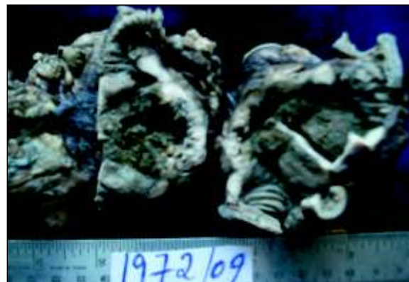
Figure 2) Gross specimen of ileum cut opened showing irregular greywhite ulcer-nodular growth.