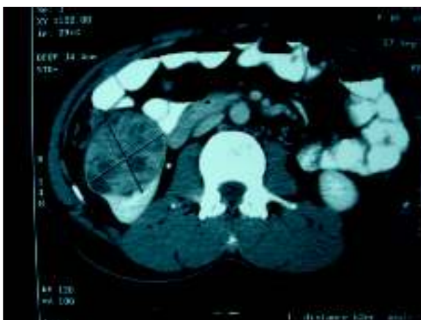
Figure 3 -C T image showing heterogeneously enhancing cystic mass in the lower pole of right kidney.