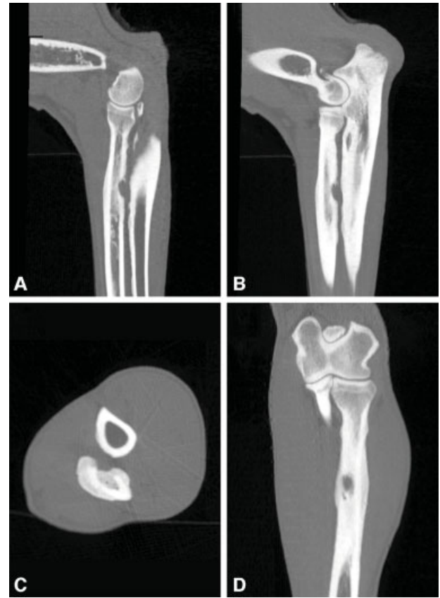
Fig. 2 Computed tomographic images 24 days after presentation of the right thoracic limb. (A and B) Sagittal multiplanar reconstructions at the level of the previous sequestrum. The sequestrum is no longer visualized and a concave region of lysis persists in the caudal radial cortex at the level of the nutrient foramen. (C) A transverse plane showing the concave lysis of the caudal radial cortex with severe endosteal new bone and smooth periosteal reaction. (D) A dorsal plane of the caudal radial cortex.

On Day 24, the dog was improving clinically at home. Re-evaluation revealed she was mildly lame on the right thoracic limb with mild, nonpainful swelling over her right radius. Radiographs were acquired at this recheck evaluation and the osseous sequestrum was not detected. A recheck sedated CT scan was performed for further investigation and showed a healing lytic lesion of the radial diaphysis, and resolution of