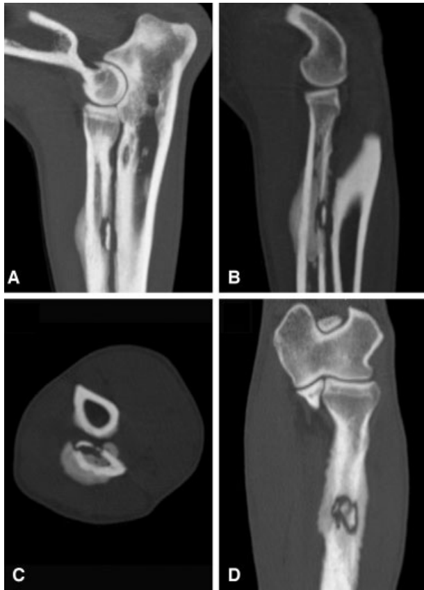
Fig. 1 Computed tomographic images of a sharp (bone) kernel of the right thoracic limb. (A and B) Sagittal multiplanar reconstructions demonstrating a thin bone sequestrum along the caudal radial cortex with smooth periosteal reaction along dorsal cortical margin and extensive new endosteal new bone formation. (C) A transverse plane at the level of the sequestrum. (D) A dorsal plane of the sequestrum in the radius.

examination, haematology, chemistry panel, urinalysis, urine culture and thoracic radiographs, all of which were unremarkable. A fine-needle aspirate from the region adjacent to the right radial sequestrum in the region of the involucrum had marked suppurative, septic inflammation featuring rod-shaped bacteria. The sample was highly cellular and comprised mostly of neutrophils that were often karyolytic with phagocytized rod-shaped bacteria and fewer variably vacuolated macrophages. Aerobic, anaerobic and fungal cultures of the bone aspirate were negative, which may be attributed to a low volume sample.