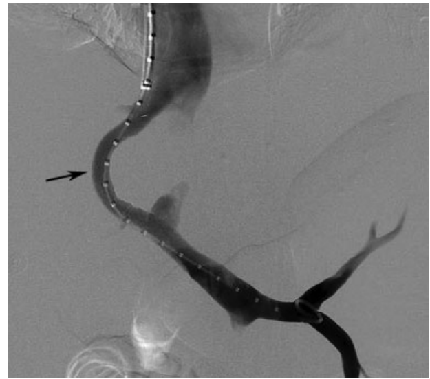
Fig. 1 TIPS in the setting of elevated MELD score. A 49-year-old woman with hepatitis C virus liver cirrhosis referred to IR for emergent TIPS in the setting of massive EV bleeding and disseminated intravascular coagulation. At the time of referral, patient failed endoscopic treatment and was in critical condition with calculated MELD score of 40. TIPS created uneventfully (arrow), and laboratory and clinical findings following procedure supported bleeding cessation. Nonetheless, patient's condition did not improve, a do-not resuscitate status was assigned, and she died due to multiorgan failure 2 days post-TIPS. Though TIPS may be applied in acutely bleeding patients with high MELD scores, likelihood of survival is extremely poor. Given poor anticipated clinical outcomes, open discussion that conveys anticipated course to patient and family is critical in clinical decision-making process.

Differentiation between acute VH and other sources of upper GI bleeding in the cirrhotic patient is an important