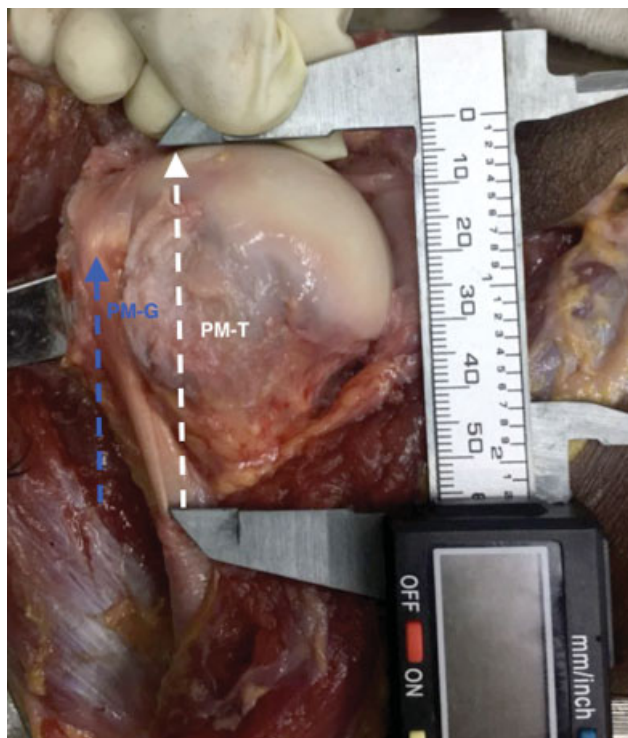
Fig. 1 PM-T distance: distance from the superior edge of pectoralis major to the tangent to the top of humeral head. PM-G distance: distance from the superior edge of pectoralis major to the superomedial tip of the GT. GT, greater tuberosity; PM-G, distance between the upper edge of pectoralis major and tangent to the top of humeral head; PM-T, distance between the superomedial tip of greater tuberosity and the upper edge of the pectoralis major tendon PM-T.

Mean \pm standard error of the mean (SEM; 95% confidence interval [CI]) was calculated for the PM-T and PM-G distances.