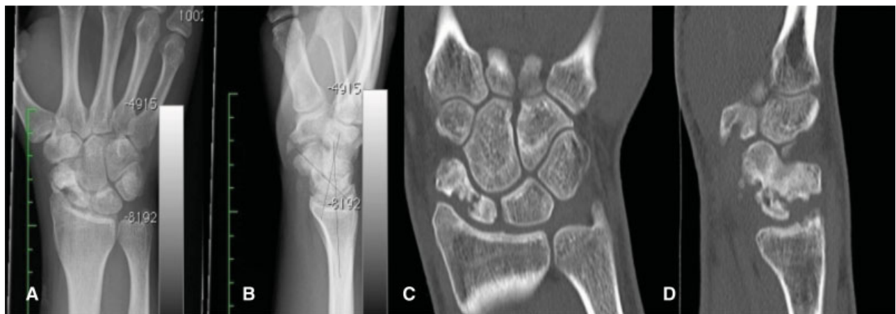
Fig. 3 Plain radiographs (A and B) and computed tomography images (C and D) show a nonunited scaphoid waist fracture with diffuse sclerotic changes of the proximal and distal poles, and deficient articular surface of the waist.

the scaphoid is not an option. The premise of replacing the proximal scaphoid with the MFT is that the outcome would be better and more durable than those obtained by salvage options such as scaphoid excision and four corner arthrode-