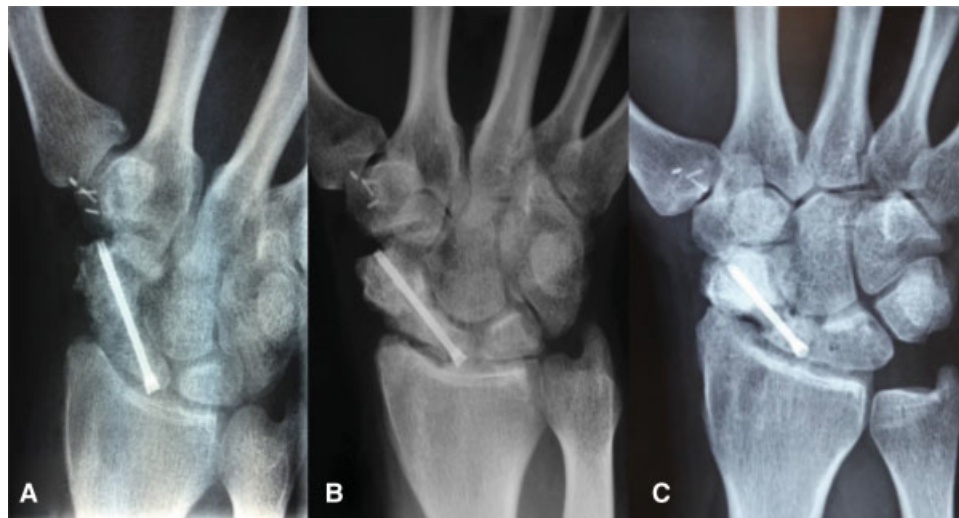
Fig. 4 Postoperative plain radiographs at (A) 2 months, (B) 12 months, and (C) 36 months.

Bürger et al 2 reported on 16 patients treated with MFT graft for scaphoid reconstruction. They reported healing in 15 of 16