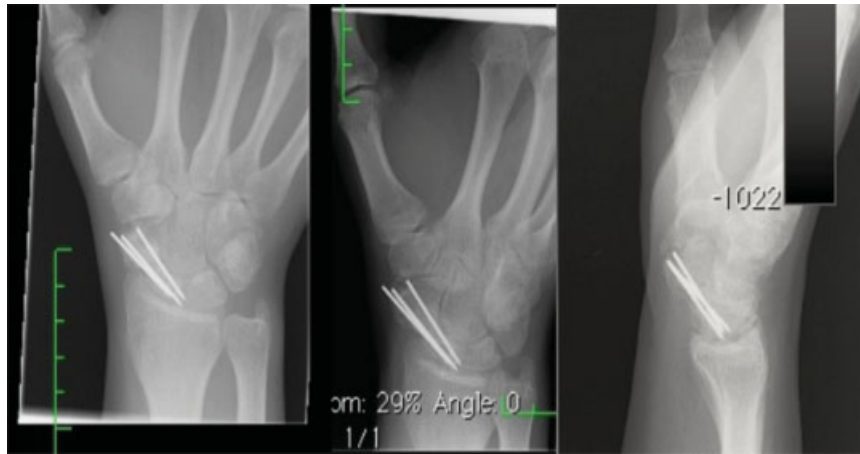
Fig. 2 Plain radiographs of scaphoid after iliac crest bone graft and Kirshner wire fixation.