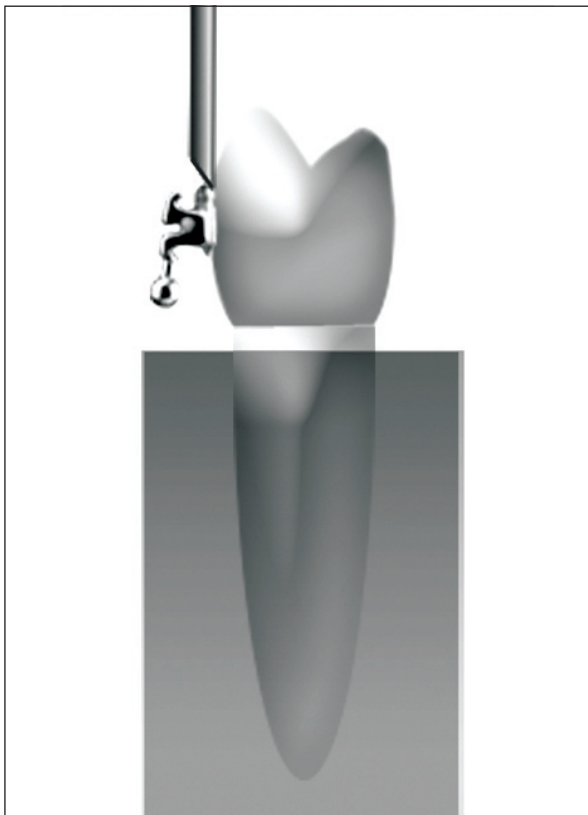
Figure 2. Schematic representation of the specimen in the test machine. The standard knife edge was positioned to make contact with the bonded specimen and directed parallel to the long axis of the crown of the tooth.

The findings of the present study demonstrate that fluorosis significantly reduced the shear bond strengths of the brackets to enamel. The mean shear bond strength of the fluorosed teeth group was 13.94±3.24 MPa, while the control group was 19.29±4.71 MPa. This result is consistent with Weerasinghe et al 7 who reported that severity of fluorosis affected the micro-shear bond strength