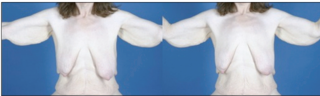
Figure 7: Another patient seen with the typical upper truncal deformities