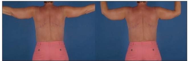
Figure 6: The same patient as in Figure 5 following brachioplasty with improvement in contour. The infrascapular scars bilaterally are those of concomitant back-roll excisions