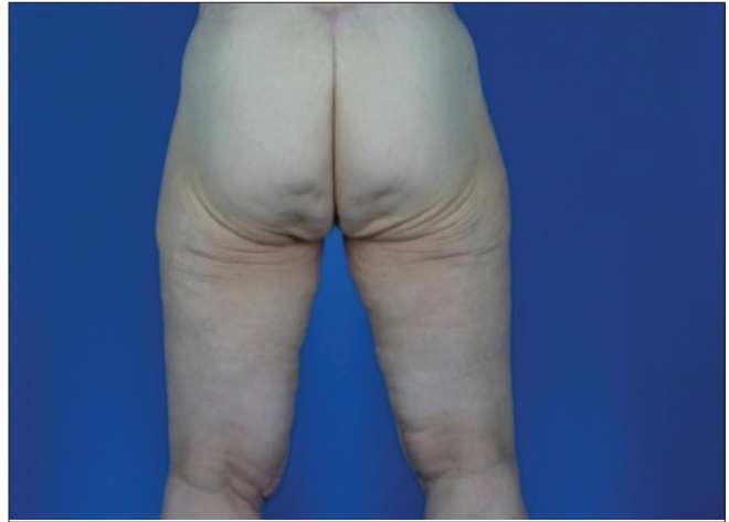
Figure 4: The same patient as in Figure 3 following medial thigh lift. The lower part of the operative scar is seen on the medial aspect of the popliteal crease bilaterally