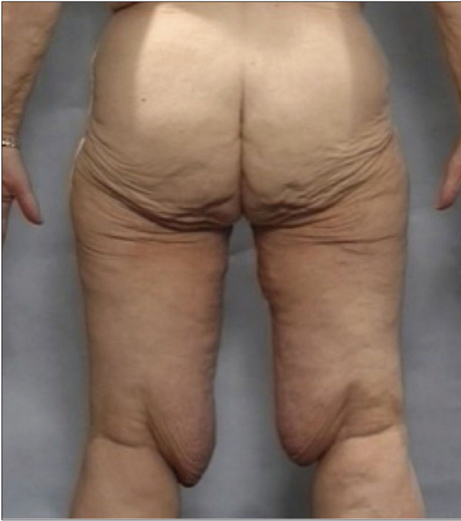
Figure 3: An MWL patient prior to a medial thigh lift