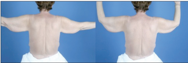
Figure 5: A patient with the typical "bat-wing" deformity bilaterally