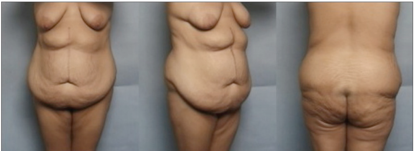
Figure 1: A patient following massive weight loss with typical lower truncal deformities

MWL patients are quite variable in their presentation despite having multiple problems in common. There are three factors that play a role in this diversity; namely their BMI at presentation, their fat deposition pattern, and the quality of skin-fat envelope. MWL patients stabilize at a particular BMI after weight loss which may differ from patient to patient. It is wise for the plastic surgeon to consult with the bariatric surgeon before considering body-contouring surgery to determine whether or not the patient has reached the final plateau. All humans pose genetically controlled fat deposition patterns as well as fat loss patterns. Males generally deposit more visceral fat as they gain weight while females tend to deposit more extra-peritoneal fat. Asking the patient to lie supine can help the plastic surgeon identify the extent of intra-abdominal or visceral fat; if the abdomen is scaphoid in the supine position, it is likely that abdominal wall plication will be successful in flattening the belly contour. Conversely, if the abdomen is convex in the supine position, it is unlikely that abdominal wall plication will be effective. In general, the lower the BMI at presentation, the better the result of body contouring. The quality of the skin-fat envelope of the MWL patients also affects their presentation and treatment. Patients with large BMI drops exhibit more redundancy and laxity than those with small BMI drops. Patients with thick fat layers after MWL have a nonpliable