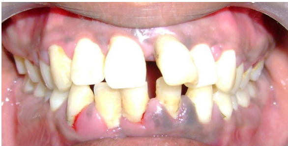
Figure 1. Initial presentation showing gingival inflammation, papillary enlargement and distolabial migration of permanent left upper central incisor.

The patient was informed about his oral condition, and a comprehensive treatment plan was presented to him. The left maxillary permanent central incisor was extracted, and full-mouth scaling and root planning were performed under local anesthesia. This procedure was supplemented with systemic antibiotic therapy consisting of amoxicillin (500 mg tid for 7 days) and metronidazole (400 mg tid for 7 days). After 6 weeks, the patient was again examined clinically; because of the persistence of periodontal lesions, he was advised to undergo flap surgery to provide access to instrumentation and regenerative therapies. Sufficient healing was achieved after the surgical management; next, a fixed partial denture made of porcelain fused to metal was fabricated and inserted in relation to teeth 11, 21, and 22. After