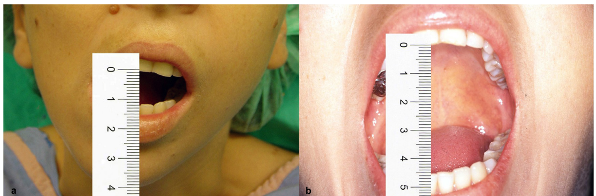
Figure 3a, b. Pre-operative and post-operative mouth opening of the case 3 (Postoperative mouth opening one year after surgery).