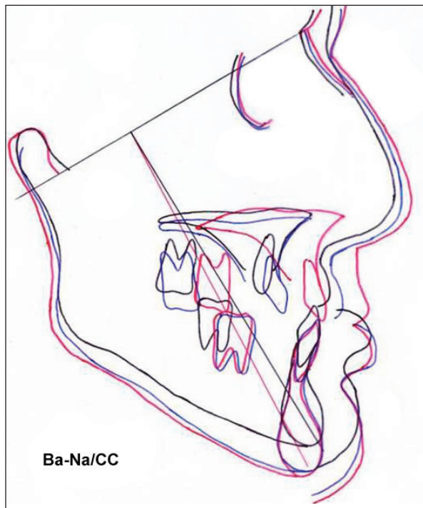
Figure 7. Cephalometric superimposition (black line: initial, blue line: pre-surgical, red line: final).

son of the final and 1-year post-treatment cephalograms showed minimal changes in the skeletal pattern (Figure 8 and Table 1): the maxilla had moved 1 mm backward, the mandible had moved downward slightly, the maxillary molars had settled downward, there was a slight reduction in the inclinations of the mandibular and the maxillary incisors. A small amount of increase in lower-lip fullness was found.