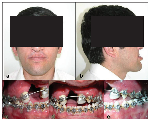
Figure 2. Pre-surgical extra oral (a-b) and intra oral (c-e) photographs of the patient.