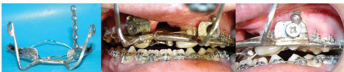
Figure 3. Modified intra oral appliance of the RED system.