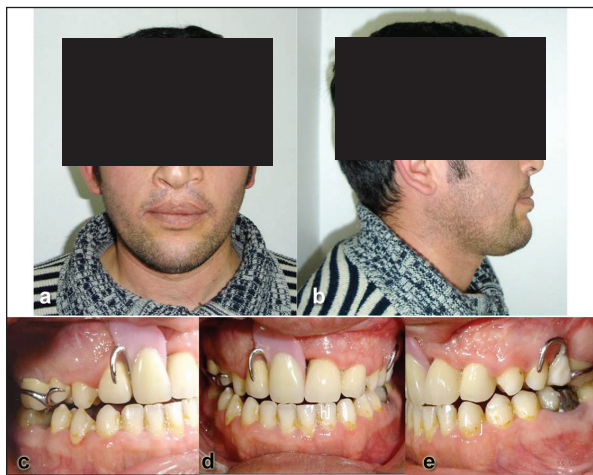
Figure 5. Extra oral (a-b) and intra oral (c-d) photographs of the patient after prosthetic treatment.