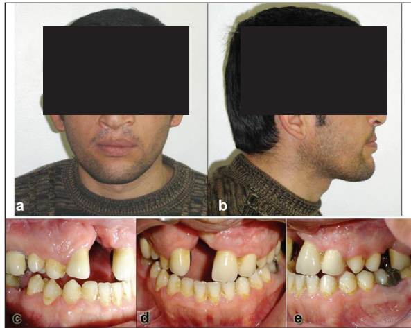
Figure 4. Post-treatment extra oral (a-b) and intra oral (c-e) photographs of the patient.