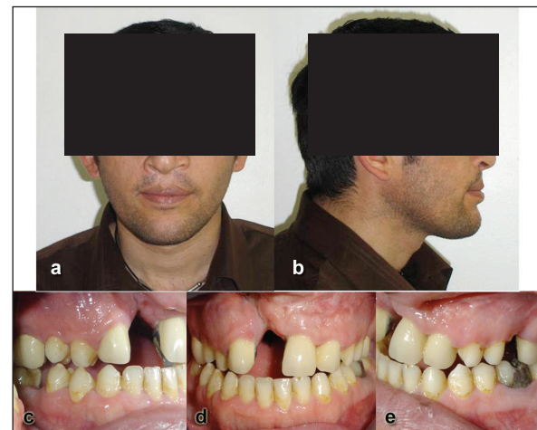
Figure 6. Extra oral (a-b) and intra oral (c-d) photographs of the patient after 1-year of post-treatment.

A considerable amount of maxillary advancement was made possible without a vertical change in facial dimensions by using a new intra oral ap-