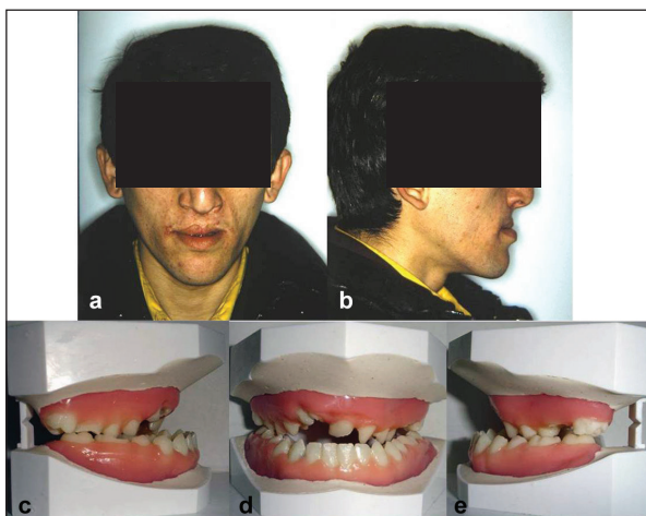
Figure 1. Pre-treatment extra oral photographs (a-b) and dental cast model (c-e) of the patient.