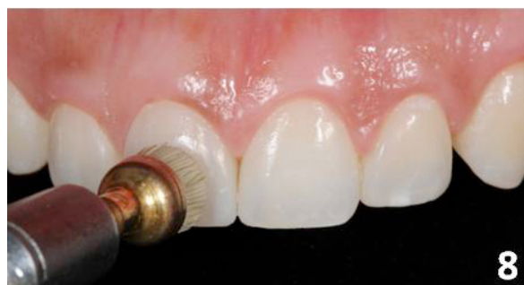
Figure 8. Polishing the restoration with a tip for polishing Jiffy Composite Polishing Brushes (Ultradent Products, Inc., South Jordan, USA).