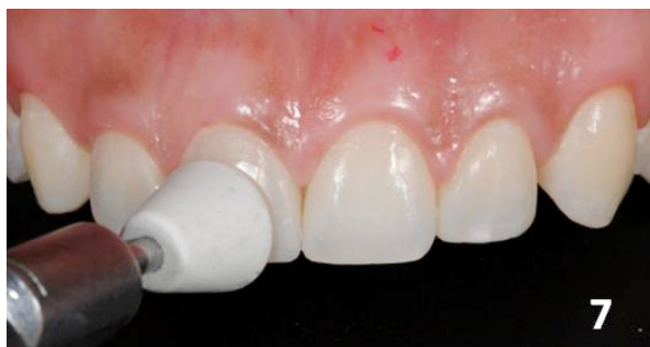
Figure 7. Polishing the restoration with a tip for polishing Jiffy Polisher Cups (Ultradent Products, Inc., South Jordan, USA).