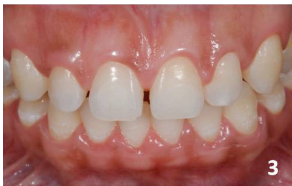
Figure 3. After performing dental bleaching with 10% hydrogen peroxide and removal of the orthodontic brackets.

Marginal excesses were removed and the incisal height was adjusted with the use of a diamond tip 1190 F (KG Sorensen Ind. & Com., Alphaville, São Paulo, Brazil) (Figure 5). Occlusal adjustment was performed, as well as in working and non-working excursions, and in protrusion. During the following session, the margins, shape, and color of restorations were again observed for immediately after the finishing and final polishing were performed with Sof-Lex Pop-On (3M ESPE Dental