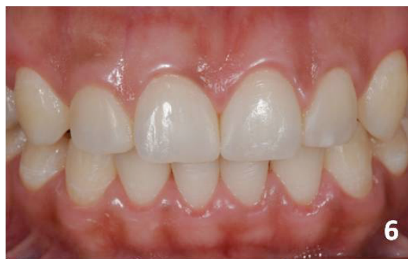
Figure 6. After finishing the restoration.