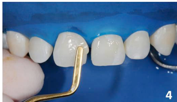
Figure 4. Insertion of Amelogen Plus composite resin (Ultradent Products, Inc., South Jordan, USA).