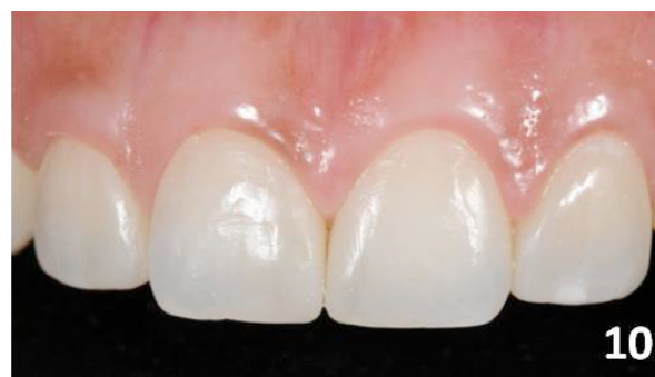
Figure 9 and 10. Final composite resin restorations.