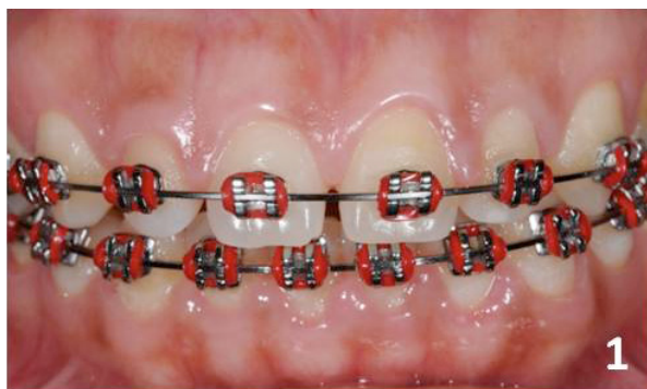
Figure 1. After conclusion and stabilization of orthodontic treatment.

The 23-year-old patient presented with generalized spacing in the maxillary anterior segment following orthodontic treatment. It was observed that after the leveling and aligning of the teeth, according to the correct position of the canines, premolars, and molars, it was not possible to obtain closure of the diastemas because it characterized a model of positive discrepancy. Specifically, the perimeter of the dental arch was larger than the sum of the mesio/distal diameters of the teeth. Therefore, these spaces were closed with resin composite (Figure 1).