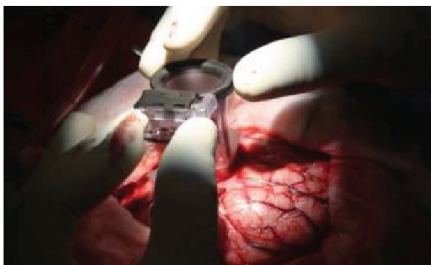
Fig. 3 Tubular retractor placement in a pediatric cystic tumor.

the same can be confirmed using copious saline irrigation into the cavity. Once satisfied the retractor is gently withdrawn ensuring hemostasis till the retractor leaves the cortical surface. Watertight dural closure is done before repositioning and fixing the bone flap (► Tables 1 and 2).