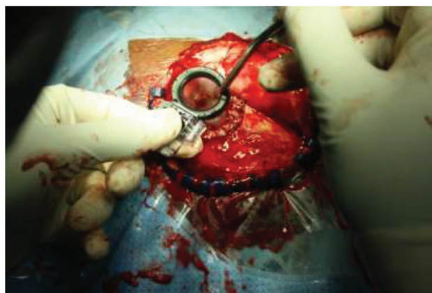
Fig. 2 Insertion of the tubular retractor in a case of spontaneous intracerebral hemorrhage.