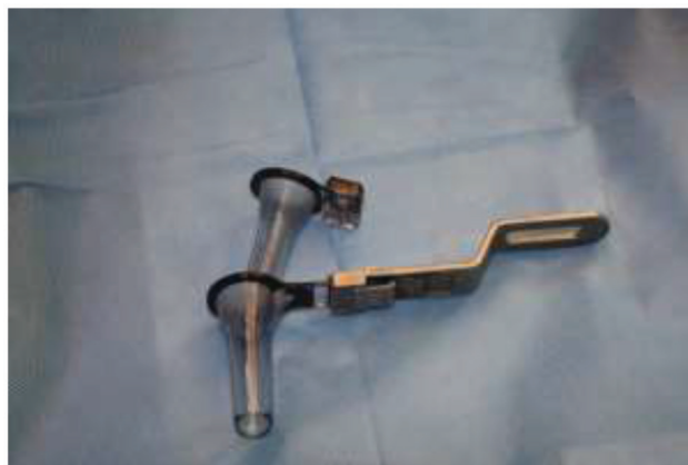
Fig. 1 The transparent tubular retractor with an outer cannula and an inner obturator which is transparent.

Based on anatomical landmarks and neuroimaging eloquent areas are marked and vascular areas are noted. A 3 to 4 cm 2 area of brain's cortical surface is exposed following craniotomy and durotomy. Centering on the trajectory entry point, trans-sulcal dissection is done. If that is not possible then a linear transcortical pial defect is created and superficial cortex is incised. Depending on the depth of the lesion an appropriate retractor is chosen and gently inserted along with a transparent obturator perpendicular to brain surface (► Figs. 2, 3). Once the tumor or hematoma is visualized, the obturator is withdrawn. The tumor can be seen bulging within the retractor. At this stage the retractor is either fixed to the table or the assistant has to hold it maintaining a constant pressure so as to prevent the retractor from being pushed out by the surrounding brain parenchyma (► Fig. 4). Depending on the consistency and extent of tumor infiltration, microinstruments are used to debulk/excise the tumor. To improve the visual field, the retractor can be gently angled. Once satisfactory excision and hemostasis is achieved,