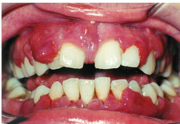
Figure 1. Pre-treatment clinical view of anterior region of the oral cavity showing severe gingival inflammation diffuse periodontal and gingival abscess formation.

The patient, a 26-year-old female, was referred to our clinic by her general dentist for severe bleeding gums, gingival hyperplasia, and halitosis. At the time, the patient was experiencing pain, severe bleeding with brushing related to her periodontal disease. She had a non-contributory medical history. However, prior to her visit to our clinic, she had never had a periodontal examination. On examination, generalized edematous, hyperplastic gingiva, bleeding on probing and calculus formation was seen (Figure 1). To determine the clinical situation of the subject, gingival index, 6 plaque index, 7 periodontal probing depths (PPD) and clinical attachment levels (CAL) of the teeth were recorded before and after the treatment by using a manual probe (Hu-Friedy Manufacturing Inc., Chicago, IL, USA) (Table