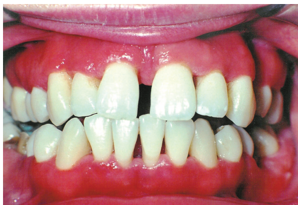
Figure 5. Post-treatment clinical view of anterior region of the oral cavity; observe reduction of gingival inflammation and acceptable gingival health.

Saliva has some antimicrobial activity against many different microorganisms. This is mainly