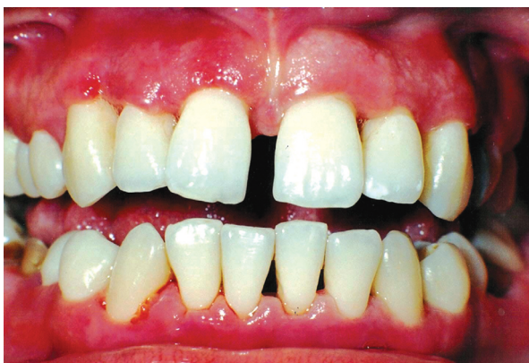
Figure 3. Clinical view of anterior region of the oral cavity after the treatment for aggressive periodontitis showing acute streptococcal gingivitis.

antacid were measured (Inolab pH meter level 2, Wissenschaftlich Technische, Germany) (Figure 4). This normal value was picked up of the same patient in different moments. At the end of this additional treatment, oral health was obtained (Figure 5).