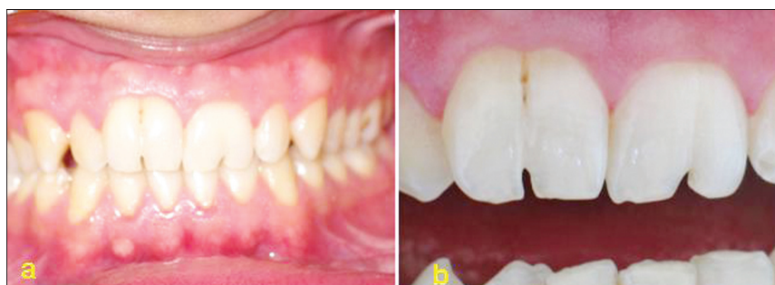
Figure 1. 1.The intraoral photographs of the case a. Frontal view of the geminated teeth b. Developmental grooves extending from incisal edge to the cemento-enamel junction

The impressions of the prepared teeth were obtained utilizing polyether based elastomeric impression material (Impregum Penta H, Duosoft Grant L, Duosoft, 3M Espe, Germany) After casting the model, all ceramic cores manufactured utilizing heat-press ceramic technique (IPS Empress 2, Ivoclar, Schaan, Liechtenstein) with # 100 lithium