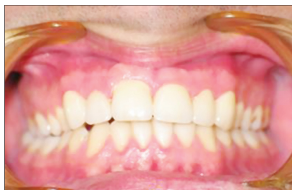
Figure 6. Frontal view of the cemented all ceramic crowns.