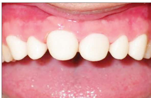
Figure 5. All ceramic cores during try-in procedure.