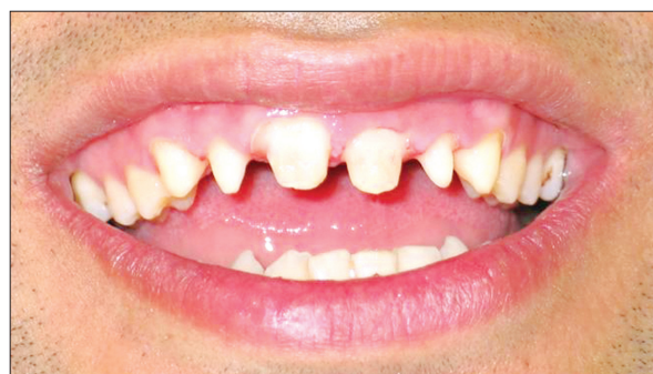
Figure 4. Frontal view of the prepared maxillary incisors and canines.