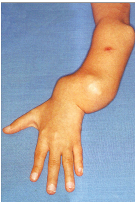
Figure 2. The clinical view of the subacromial extremities.