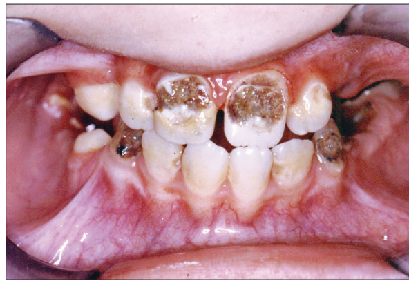
Figure 3. The intra-oral clinical view of the patient.