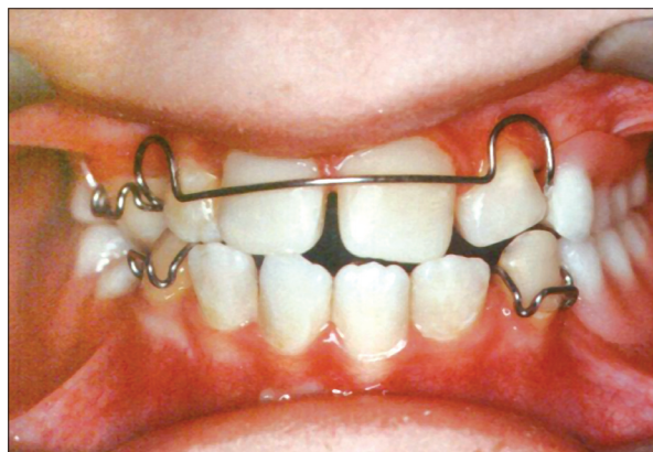
Figure 5. The intra-oral clinical view of the patient after prosthetic dental treatment.