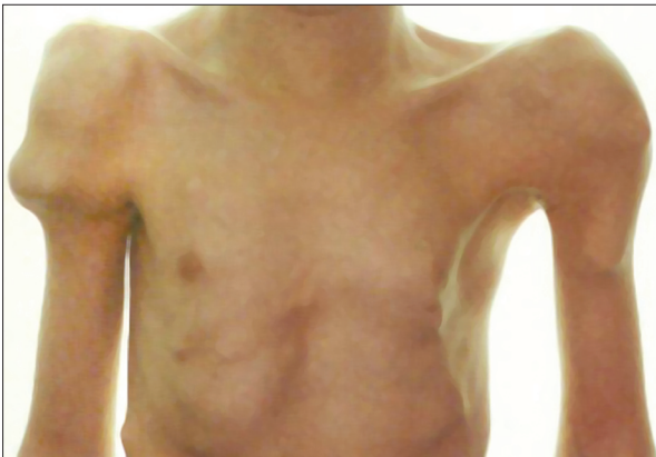
Figure 1. The clinical view of the shoulders and left side of the thorax.

Osteochondromatosis, also known as osteochondilaginous exostosis is the most frequent benign bone tumor of the skeletal system. 1-5,22 Osteochondroma may occur in some short bones and may develop endochondral ossification despite its preference for long bones. 22 Affected individuals exhibit bilateral deformities and multiple osteochondromas in the hands, wrists, legs and feet. The forearms and wrists are the most common influenced sites. These deformities include relative shortening of the ulna, bowing of the radius, ulnar deviation of the distal aspect of the radius, wrist and hand. 5,11-14 In this case, all these deformities and multiple osteochondromas were present in defined locations. However, rarely reported mul-