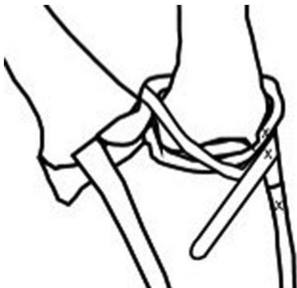
Fig. 3 Schematic representation of completed ligament reconstruction.

The free end of tendon graft is then held in tension and sutured back to the APL where the graft has already been sutured (→ Fig. 2G ). Lastly, imbrication of the APL tendon is performed, shortening it ~1 cm and effecting abduction of the thumb metacarpal (→ Fig. 2H, 3 )