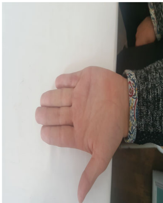
Fig. 6 Camptodactyly of the right little finger 8 months after surgery (palmar view).

no continuity of the normal tendon between the muscle belly and bony insertion. The authors suggested that the tenodesis effect of the abnormal tendon of the flexor digitorum superficialis is considered to play an important role in the incidence of the camptodactyly.