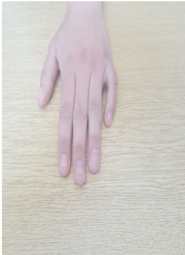
Fig. 1 Camptodactyly (dorsal view).