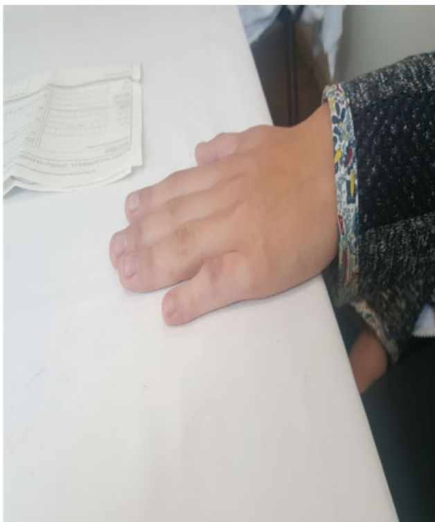
Fig. 5 Camptodactyly of the right little finger 8 months after surgery (dorsal view).

no continuity of the normal tendon between the muscle belly and bony insertion. The authors suggested that the tenodesis effect of the abnormal tendon of the flexor digitorum superficialis is considered to play an important role in the incidence of the camptodactyly.