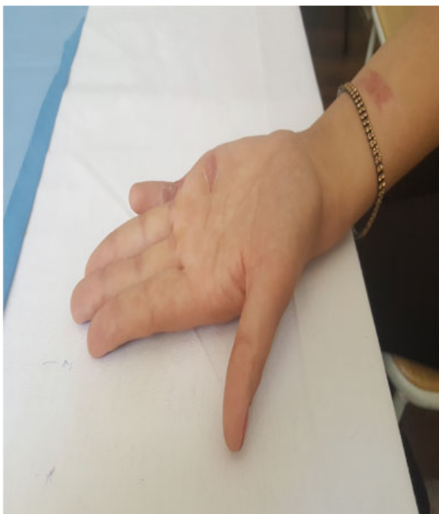
Fig. 4 Camptodactyly of the right little finger 3 months after surgery (palmar view).