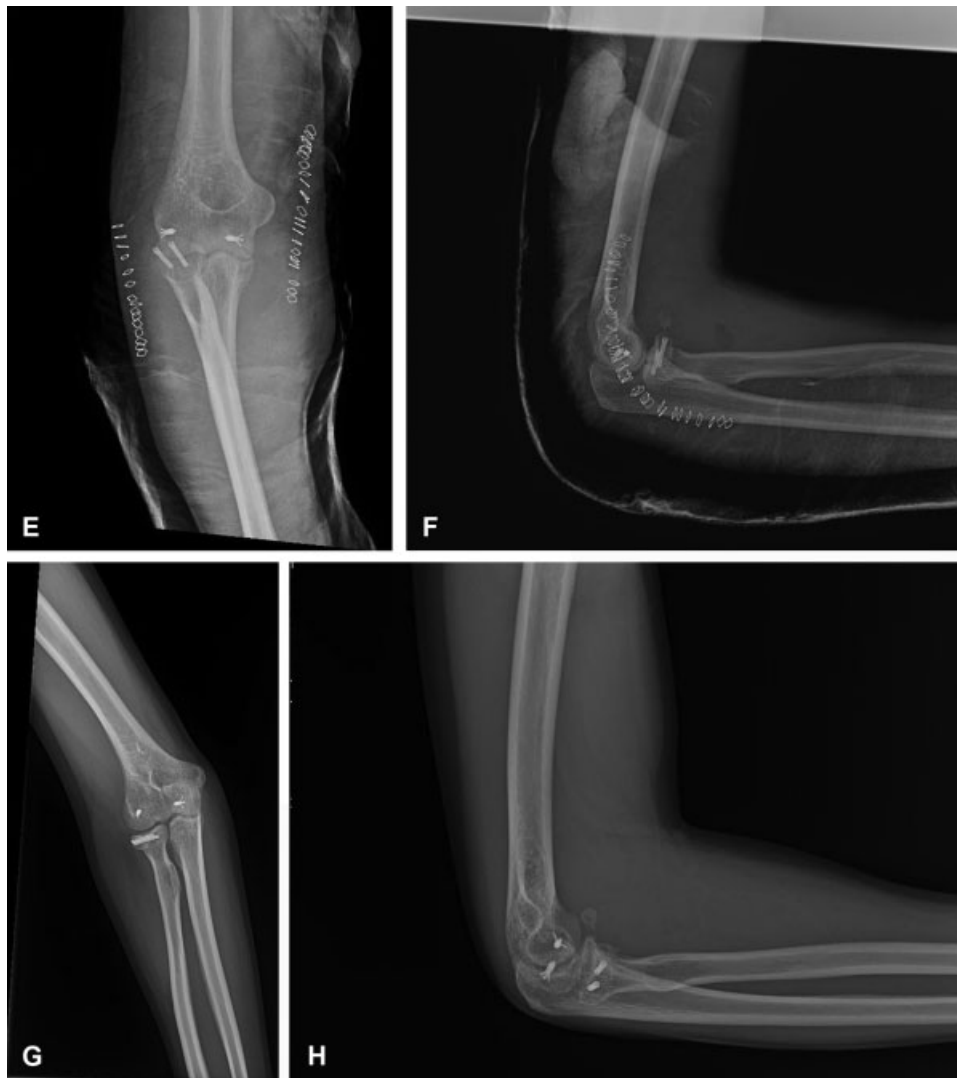
Fig. 2 (Continued)

stabilizer of the elbow joint against the varus forces and stability is strengthened if we consider the fact that anconeus muscle is not disturbed during our approach. Refixation is facilitated from the fact that both the structures are close to each other and formation of scar tissue in the postoperative period increases stability.