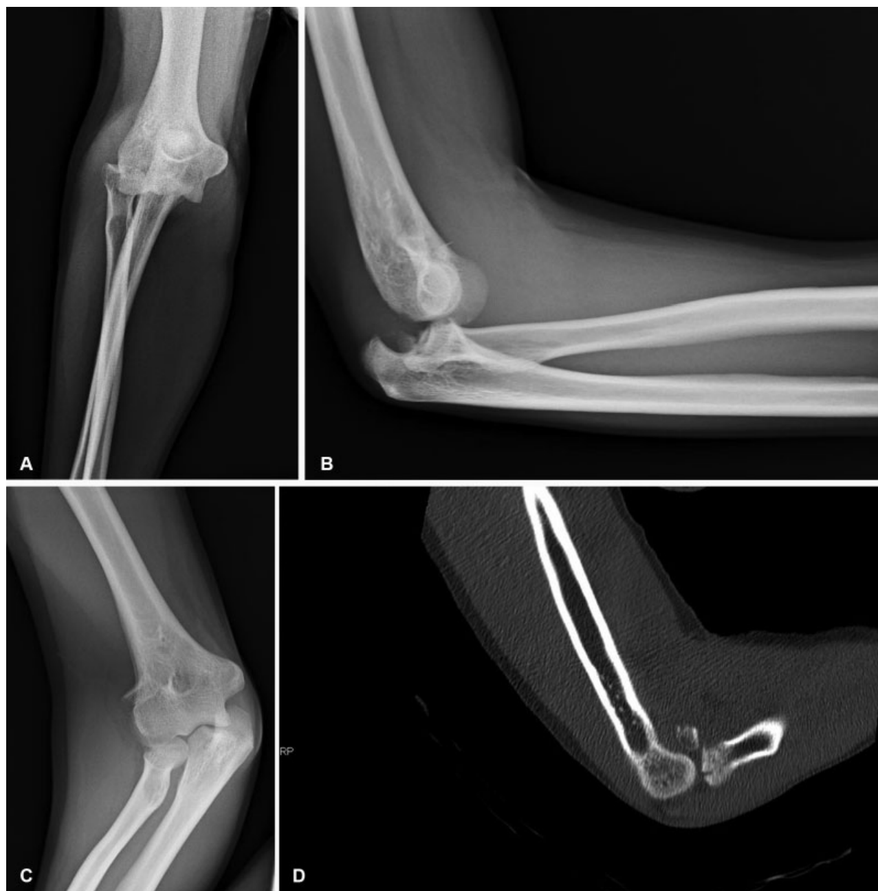
Fig. 2 Initial and postoperative X-rays of a 39-year-old male presenting a Mason IV radial head fracture after high energy trauma. Radiographs at the 12th month follow-up showing a good fracture healing. A-B-C: Post-injury X-rays; D: CT slice of the right elbow; E-F: post-operative X-rays; G-H Twelve months follow-up X-rays.

In our experience, the visualization of the anteromedial surface of the radial head was increased when compared with the limited Kocher approach as proximal detachment of the RCL facilitates maneuver of lateral dislocation of the proximal radius.