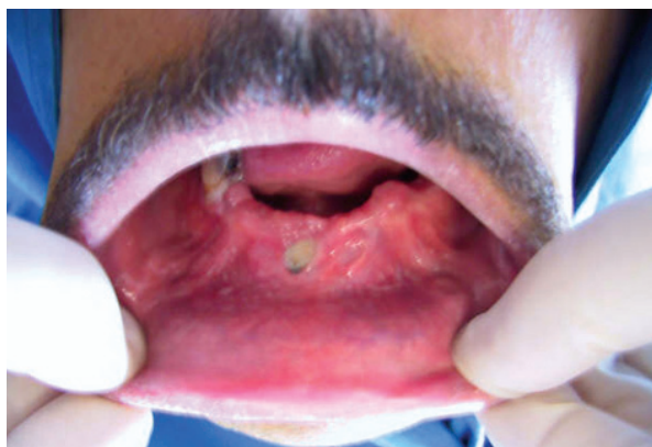
Figure 1. Intraoral view of the case.

The presence of supernumerary teeth may be part of many genetically determined syndromes and birth defect like cleidocranial dysostosis, cleft lips, cleft palate, Gardner's syndrome, and Down syndrome. And they may also accompany less frequently other syndrome including Marfan syndrome, Fabry Anderson's syndrome, Chondroectodermal dysplasia, Ehlers-Danlos syndrome, incontinentia pigmenti and Tricho-Rhino-Phalangeal syndrome. 6,9-11 There were no skeletal abnormali-