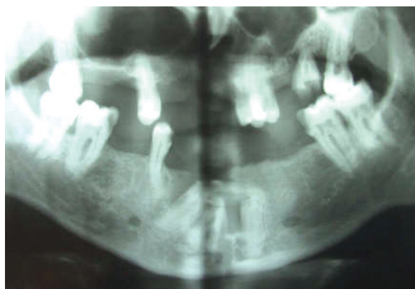
Figure 2. Panoramic radiograph showing impacted teeth in the anterior region of mandible.