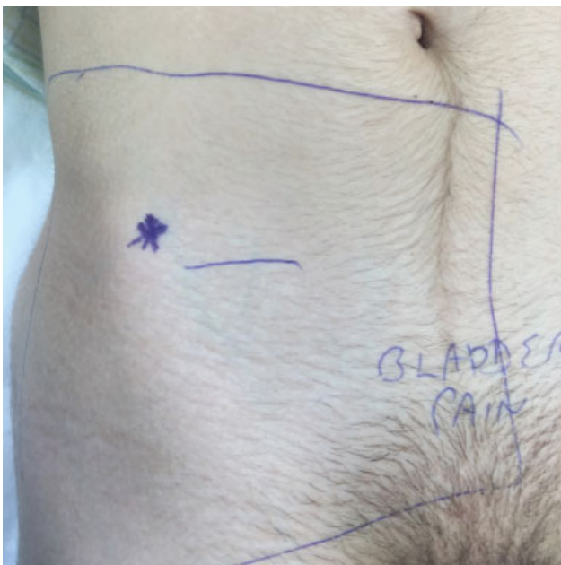
Fig. 3 Case 2, demonstrating asterisk (*) at the site of trigger spot with pain referred to the bladder. The blue line is the border to be prepared for surgery.

over the preceding 17 months, cystoscopy was normal, neuropathic medications did not help, and a sacral “interstim” did not give relief. Imaging studies were all normal. His physical examination demonstrated discrete pain over the II and IH region with referred pain to his bladder (► Fig. 3 ). Because he was tender in the right lower quadrant, local nerve block into this area was done, and gave him few hours of relief. A nerve block at T12/L1 gave relief of the urgency and frequency for 6 hours. On November 5, 15, he had the