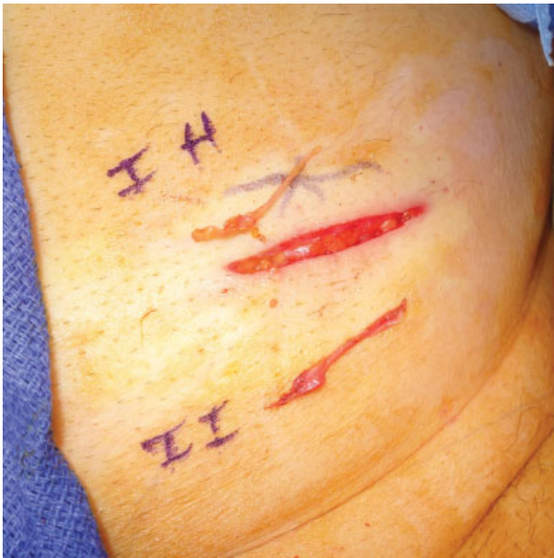
Fig. 2 Abdominal wall of patient demonstrating incision medial to the anterior iliac crest, with the excised iliohypogastric (IH) and ilioinguinal (II) nerves lying next to the incision.

over the preceding 17 months, cystoscopy was normal, neuropathic medications did not help, and a sacral “interstim” did not give relief. Imaging studies were all normal. His physical examination demonstrated discrete pain over the II and IH region with referred pain to his bladder (► Fig. 3 ). Because he was tender in the right lower quadrant, local nerve block into this area was done, and gave him few hours of relief. A nerve block at T12/L1 gave relief of the urgency and frequency for 6 hours. On November 5, 15, he had the